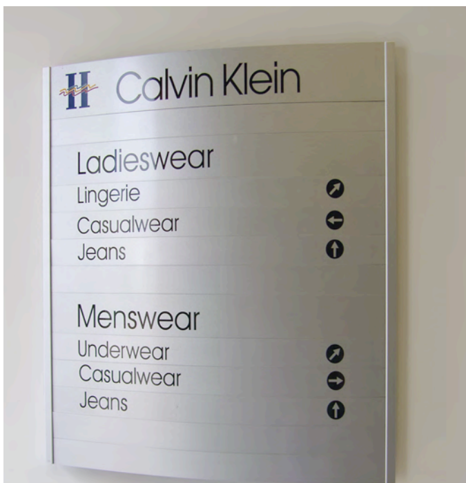
Curved Wayfinding signage, 'Flavour of the moment', from Simplex.

But how much information is the right amount to include?